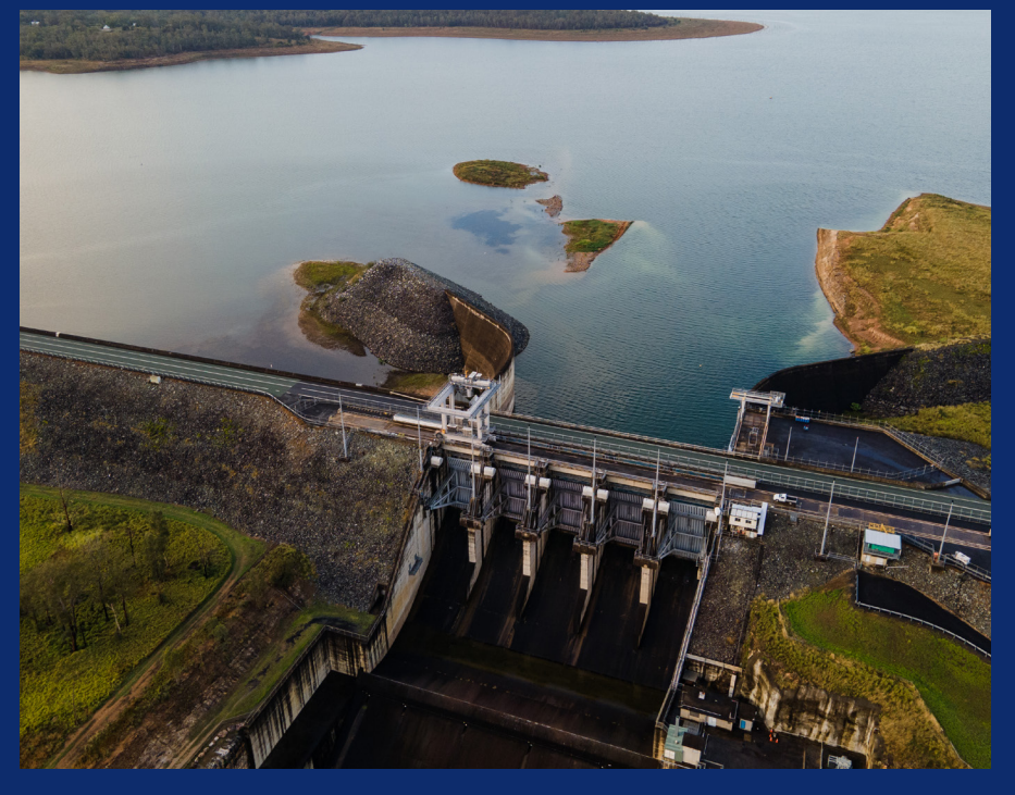
Wivenhoe Dam, South-East Queensland's largest water storage.